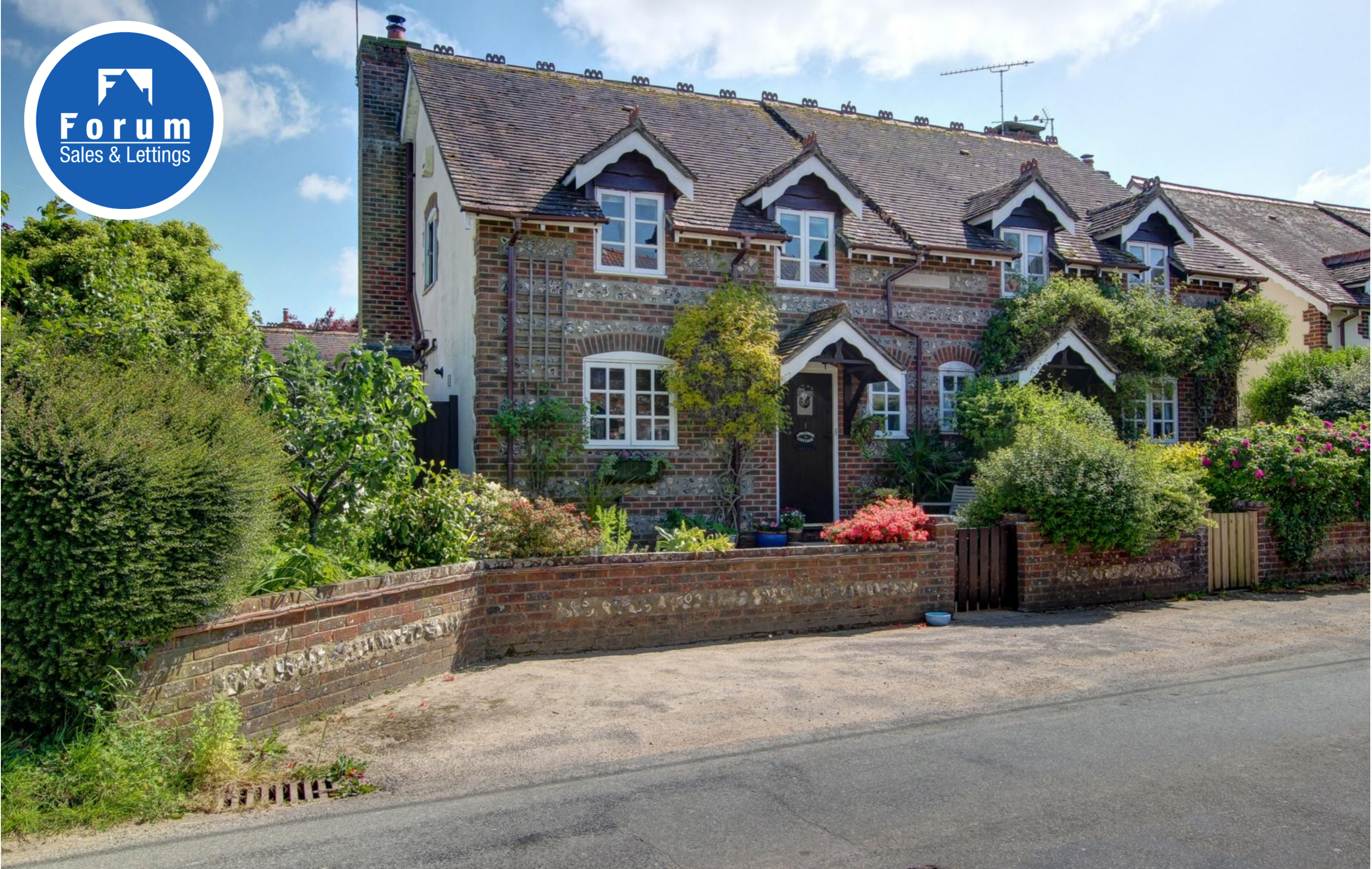
Apple Tree Cottage , West Street, Winterborne Kingston, Dorset, DT11 9AX