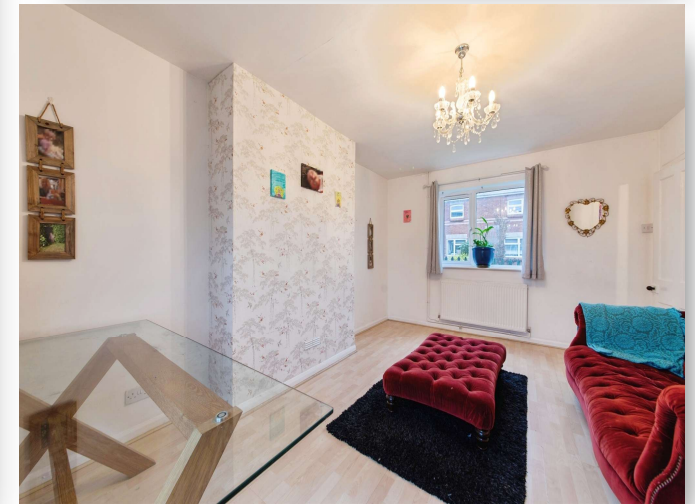
Foster Street, Heckington Sleaford NG34 9RU