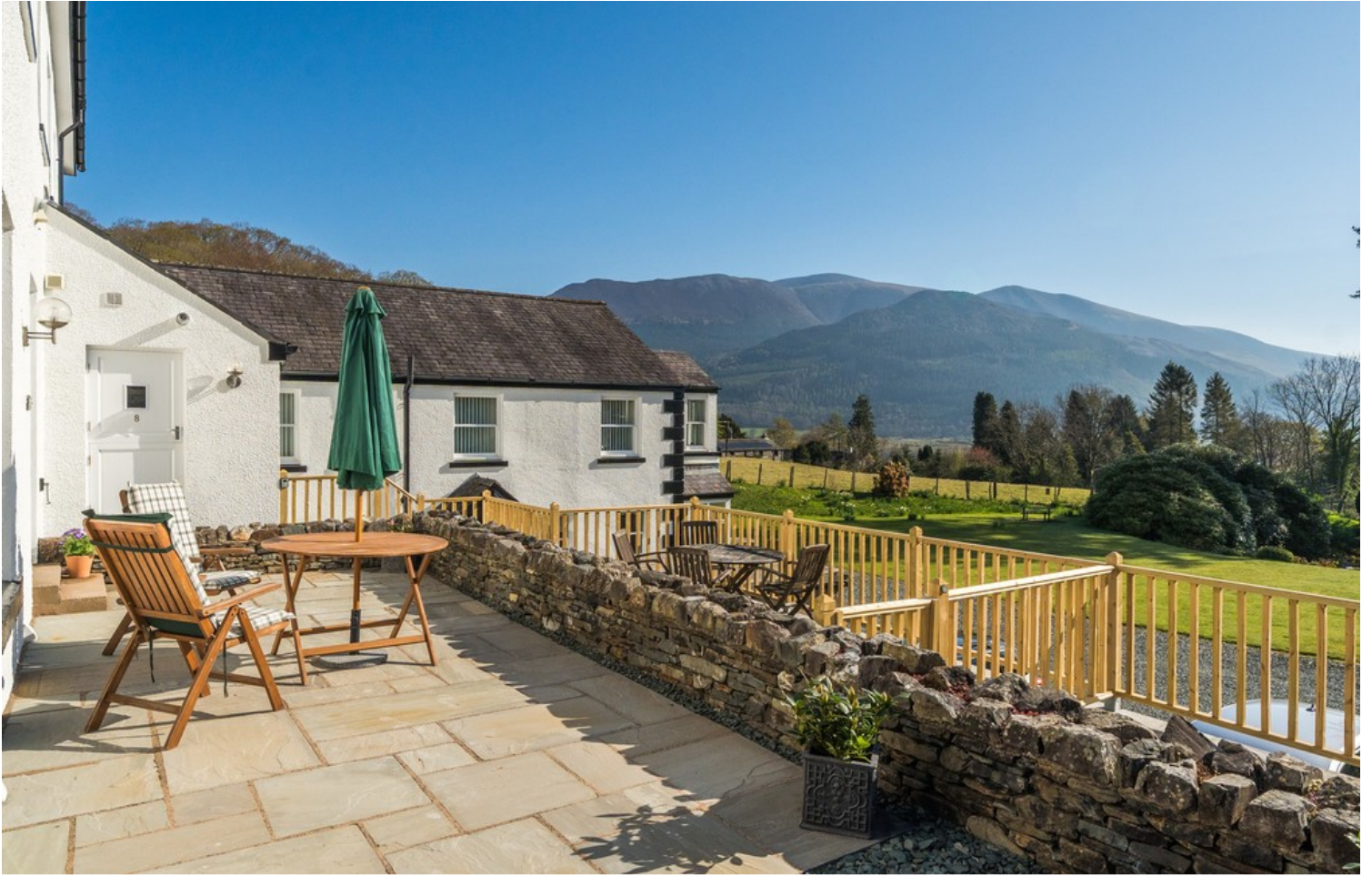
Private Paved Rear Terrace