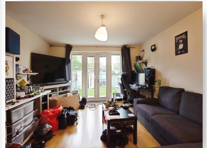
James Street, Leabrooks Alfreton DE55 1LW