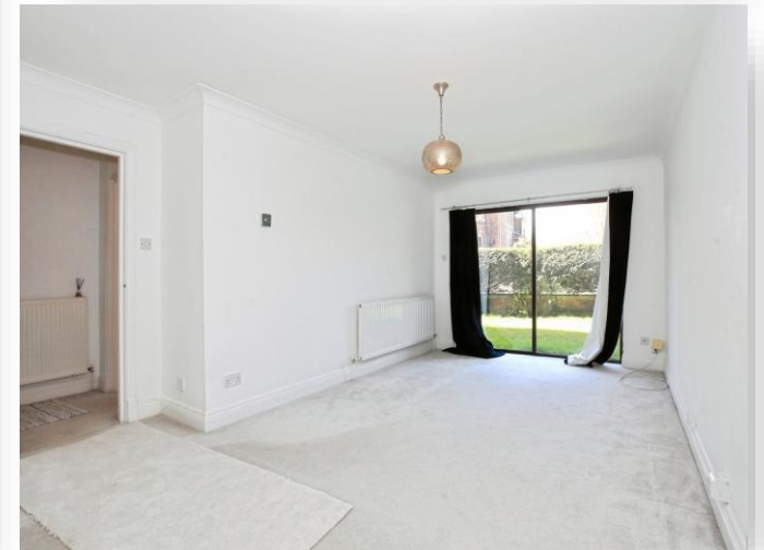
William Nichols Court Huntly Grove, PETERBOROUGH PE1 4DW