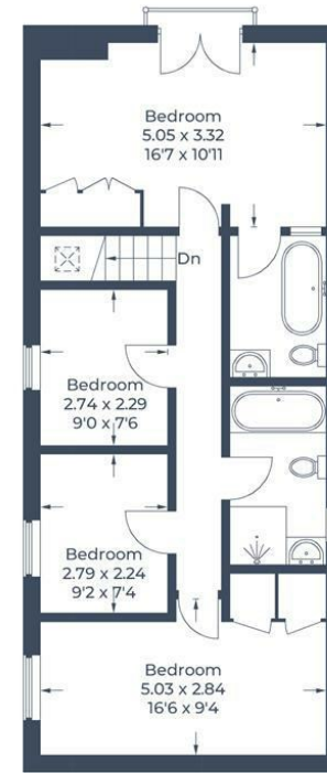
Illustration for identification purposes only, measurements are approximate, not to scale. © CJ Property Marketing Produced for Fine Country