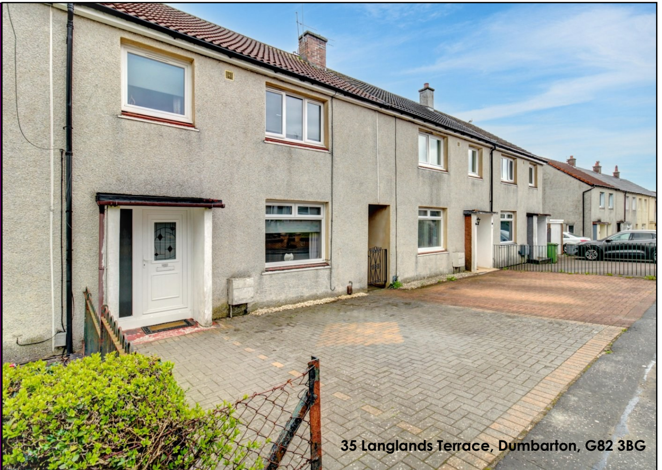
35 Langlands Terrace, Dumbarton, G82 3BG

This beautifully presented three-bedroom mid-terrace villa occupies a generous plot and offers spacious, well-designed accommodation throughout.