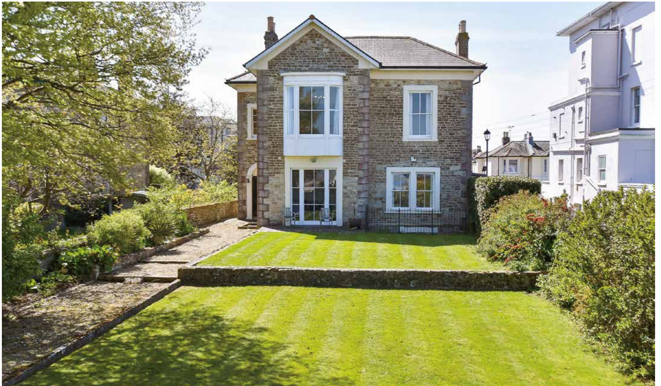
21 The Strand Ryde | Isle of Wight | PO33 1JF