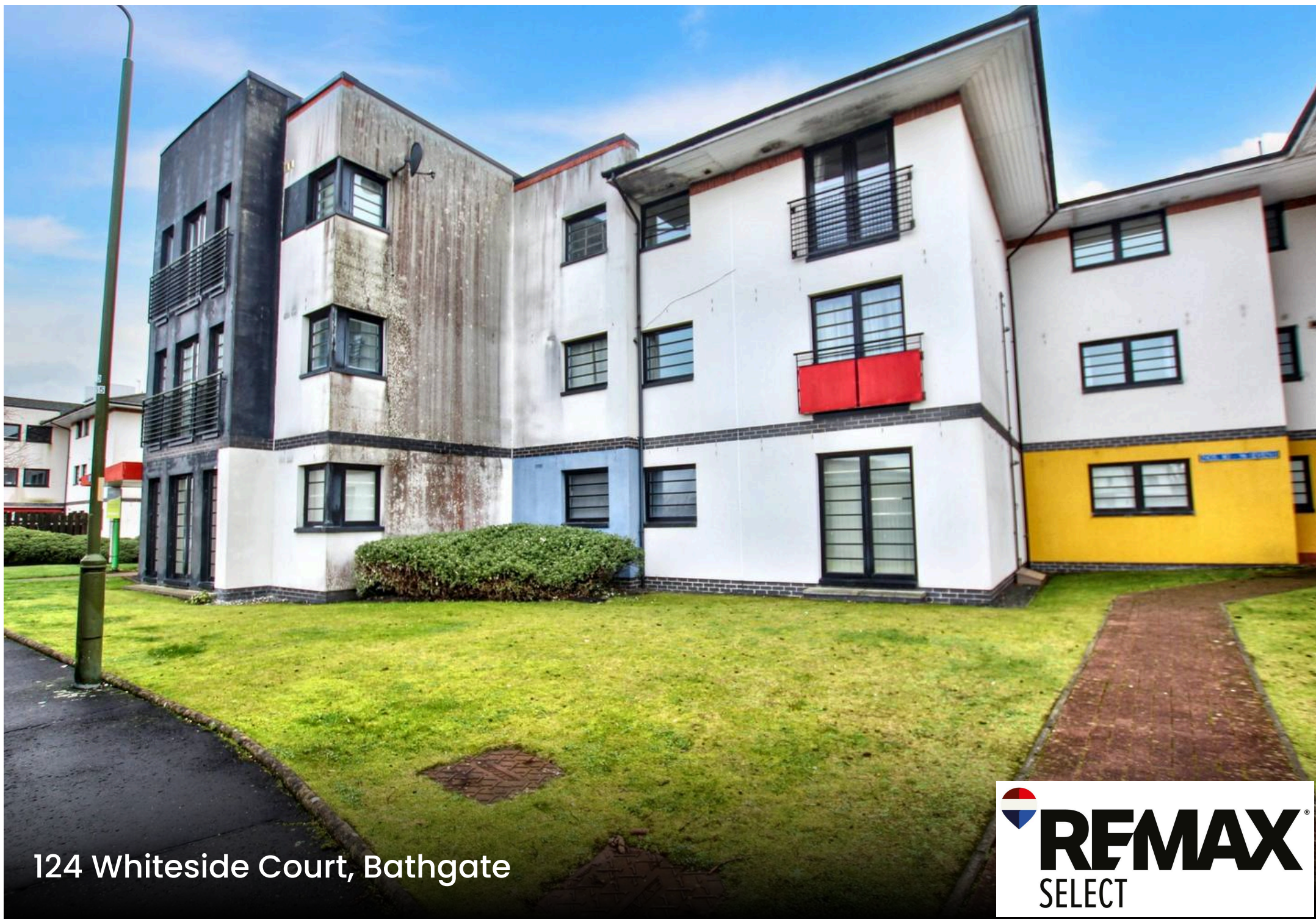
124 Whiteside Court, Bathgate