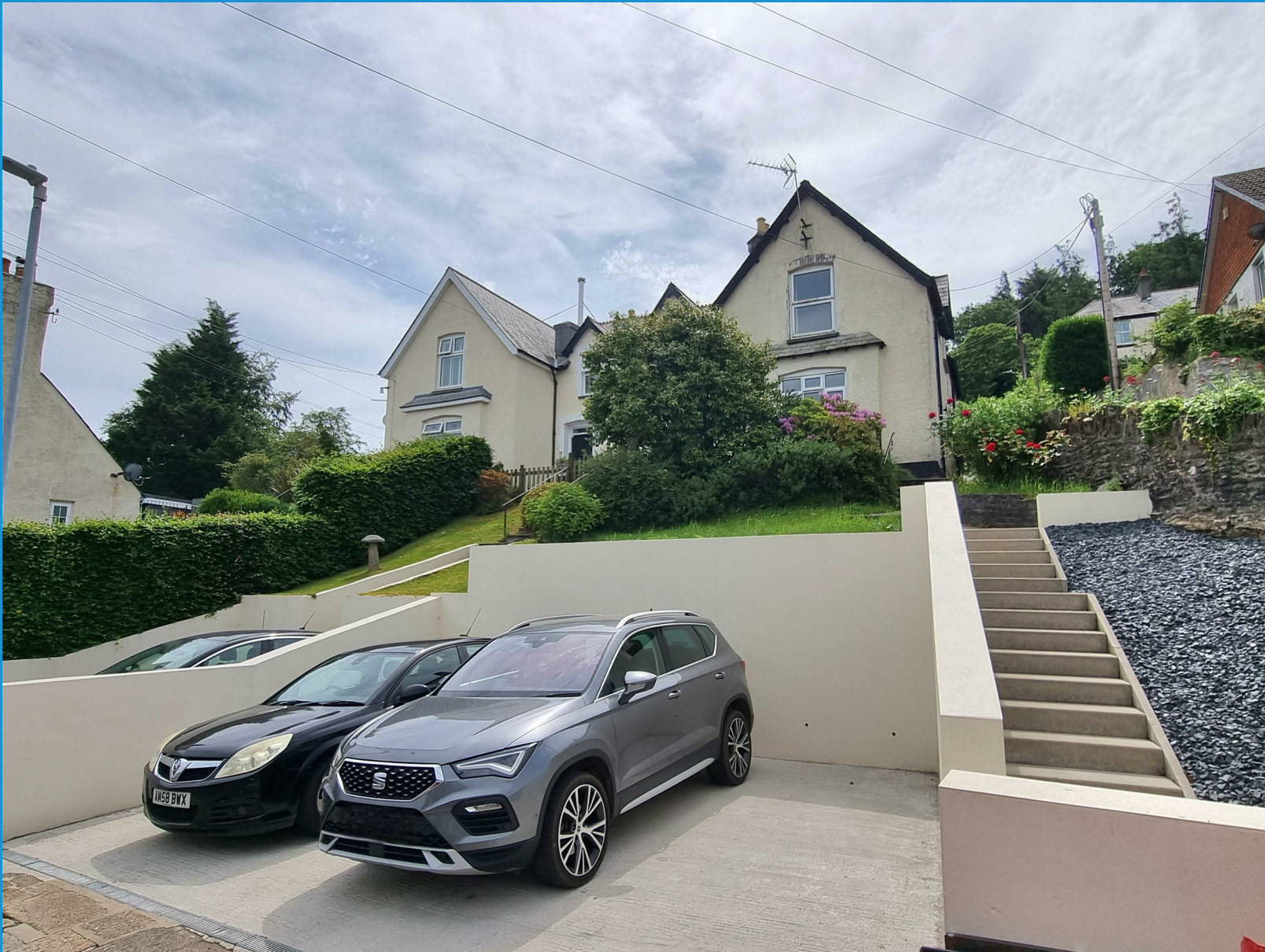
3 Westgate Terrace Launceston | Cornwall