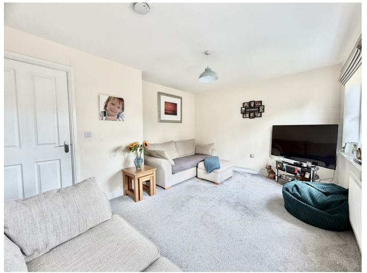
Lounge 14'8" x 11'2" max (4.489m x 3.420m max)