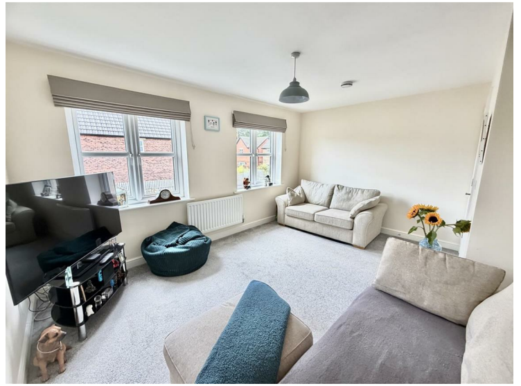
Incorporating two double glazed windows to rear and a radiator.