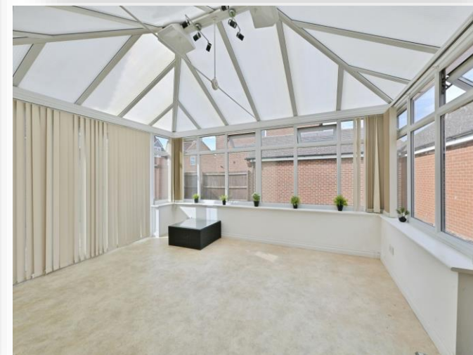
Thistle Close, Yaxley Peterborough PE7 3GF