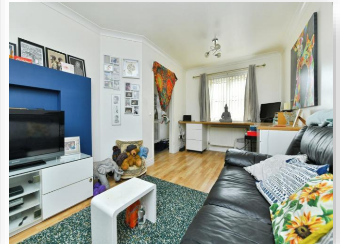
Highglen Drive, Plympton PL7 5LJ