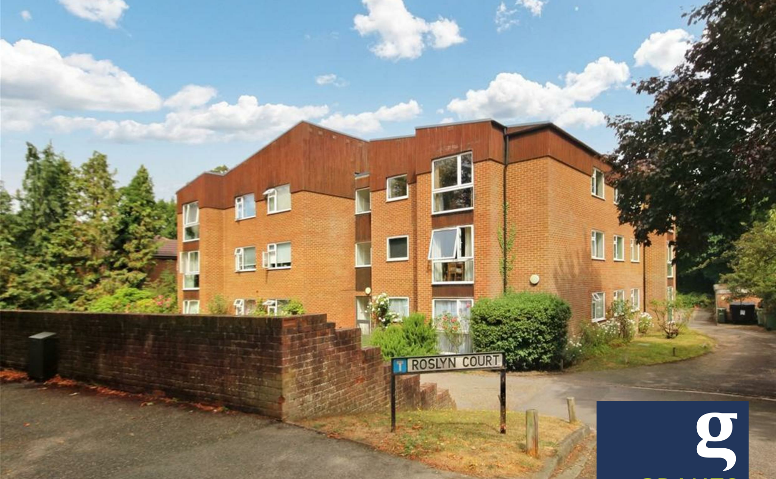
Roslyn Court, Woking, GU21 7QH