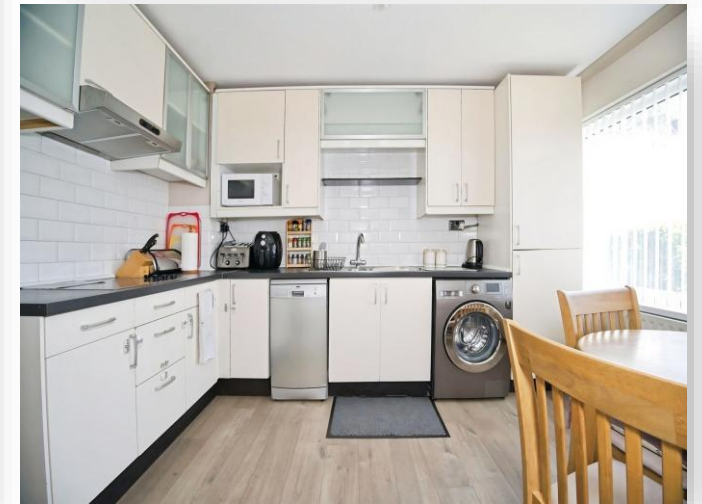
Penlan Rise, Llandough, Penarth, CF64 2LS