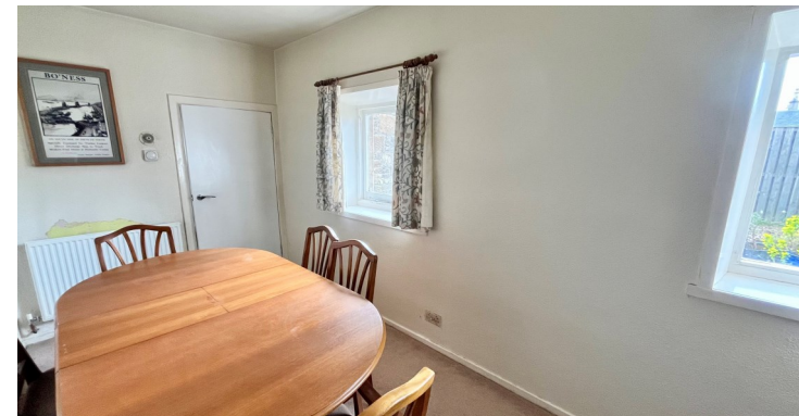
6 Hope Cottages