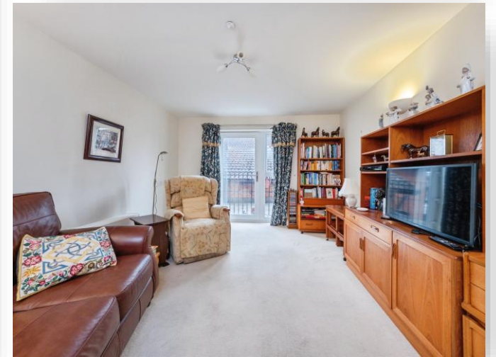
The Limes, Westbury Lane, Newport Pagnell, MK16 8FA