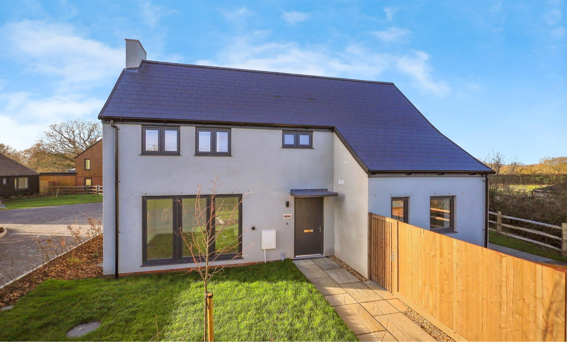
The Breton The Paddock, Upper Dicker Hailsham BN27 3RG