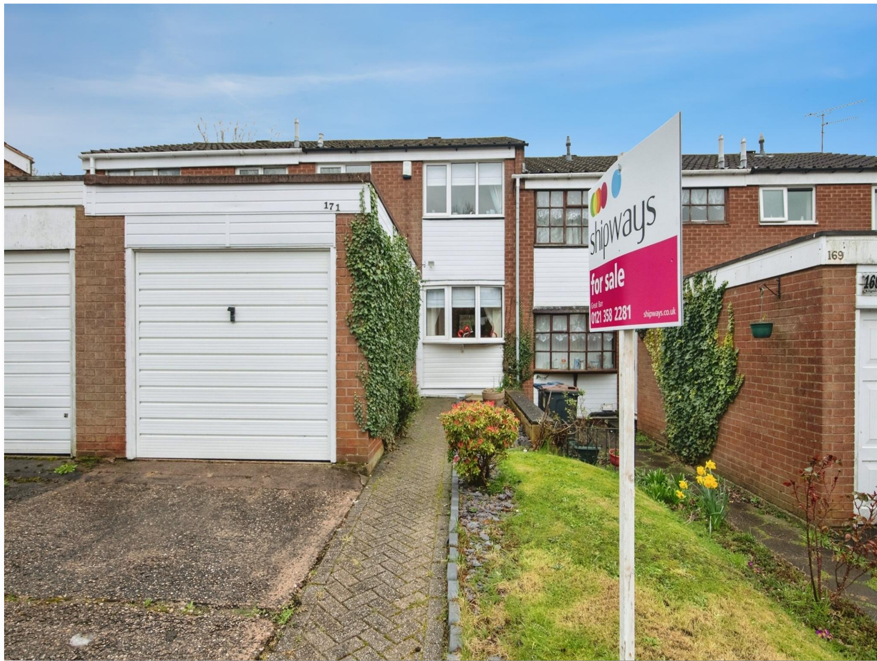
Kingsdown Avenue, Birmingham B42 1NE