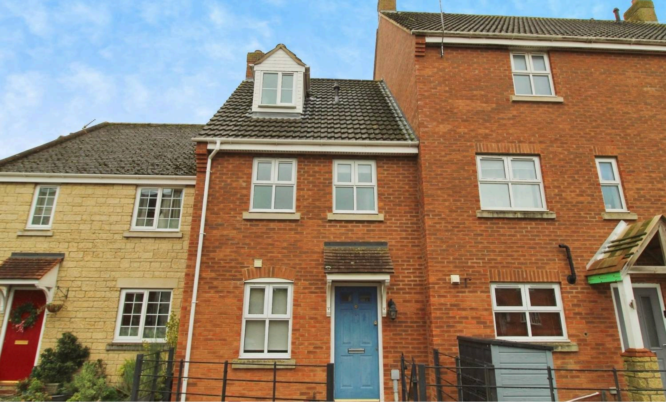
14 Mayfly Road Swindon