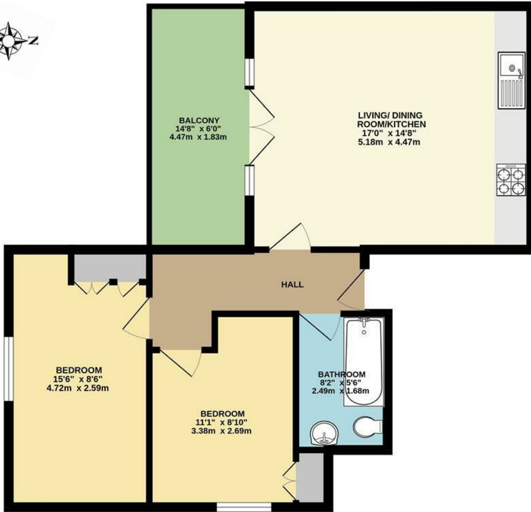
FIRST FLOOR FLAT

OAK HILL ROAD, SURBITON INTERNAL FLOOR AREA (APPROX.) 592 sq ft/ 55.0 sq m