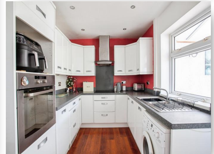
Dalton Lane, Dalton Rotherham S65 3QY