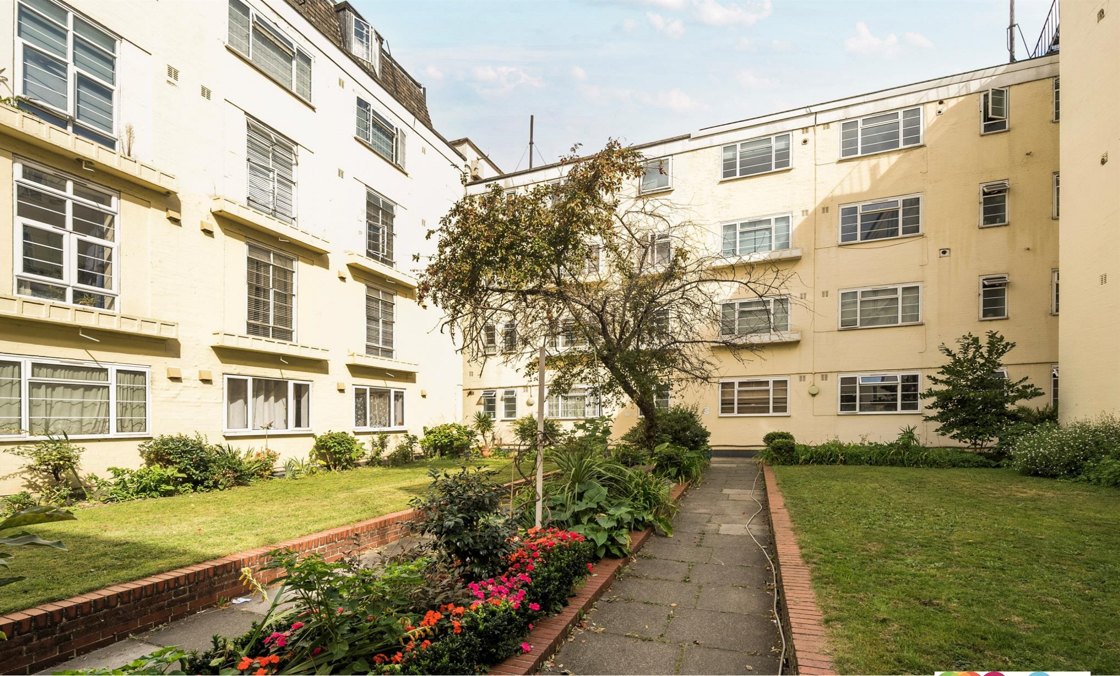
Hartington Court Lansdowne Way, London SW8