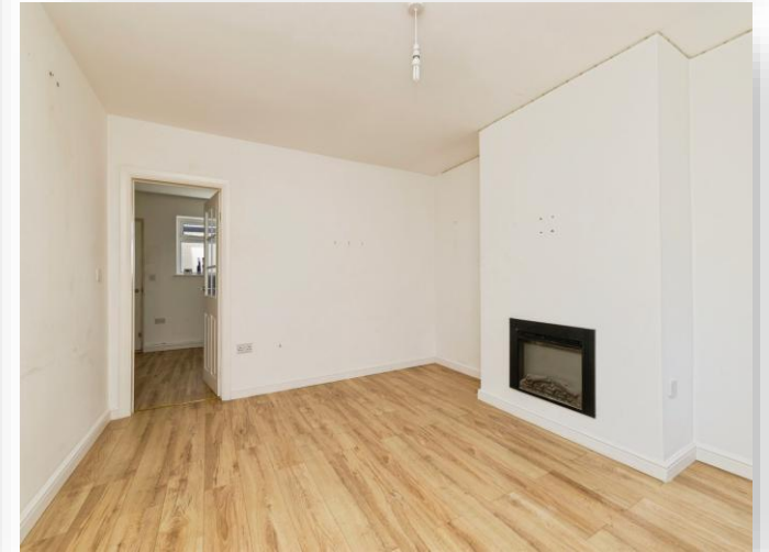
Annandale Crescent, Hartlepool, TS24 9BS