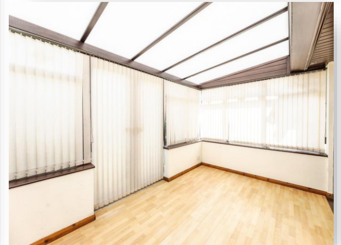
Alden Close, Morley Leeds LS27 0SG