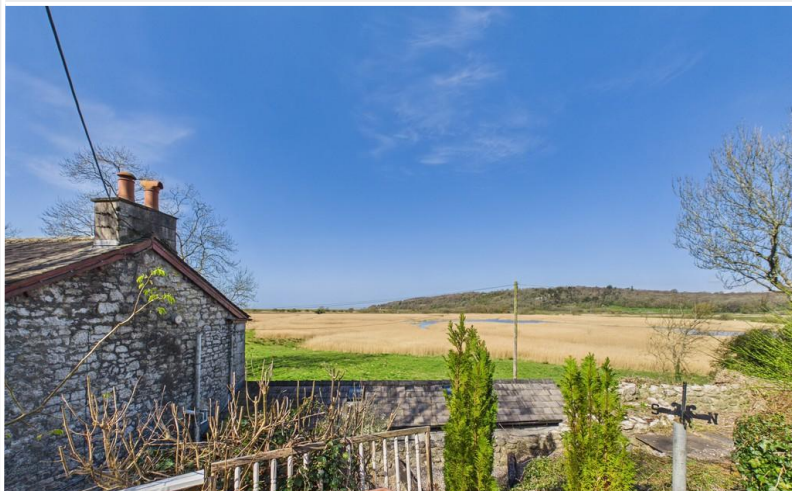
Rear Garden Views