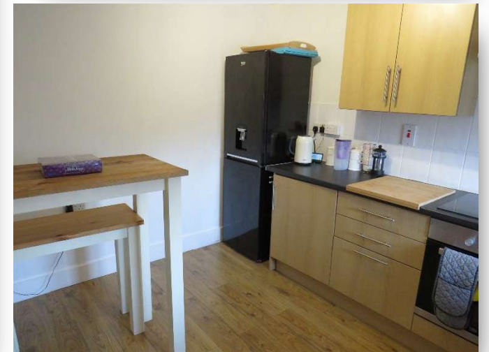
Manor House Row, Wereham, King's Lynn, PE33 9DJ