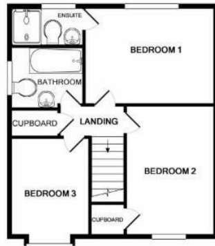
1ST FLOOR APPROX. FLOOR AREA 470 SQ.FT. (43.6 SQ.M.)

TOTAL APPROX. FLOOR AREA 1166 SQ.FT. (108.3 SQ.M.)