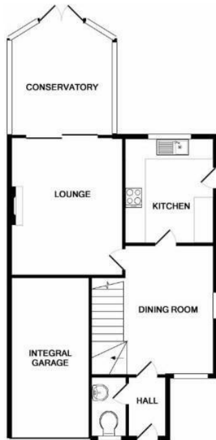
GROUND FLOOR APPROX. FLOOR AREA 696 SQ.FT. (64.7 SQ.M.)