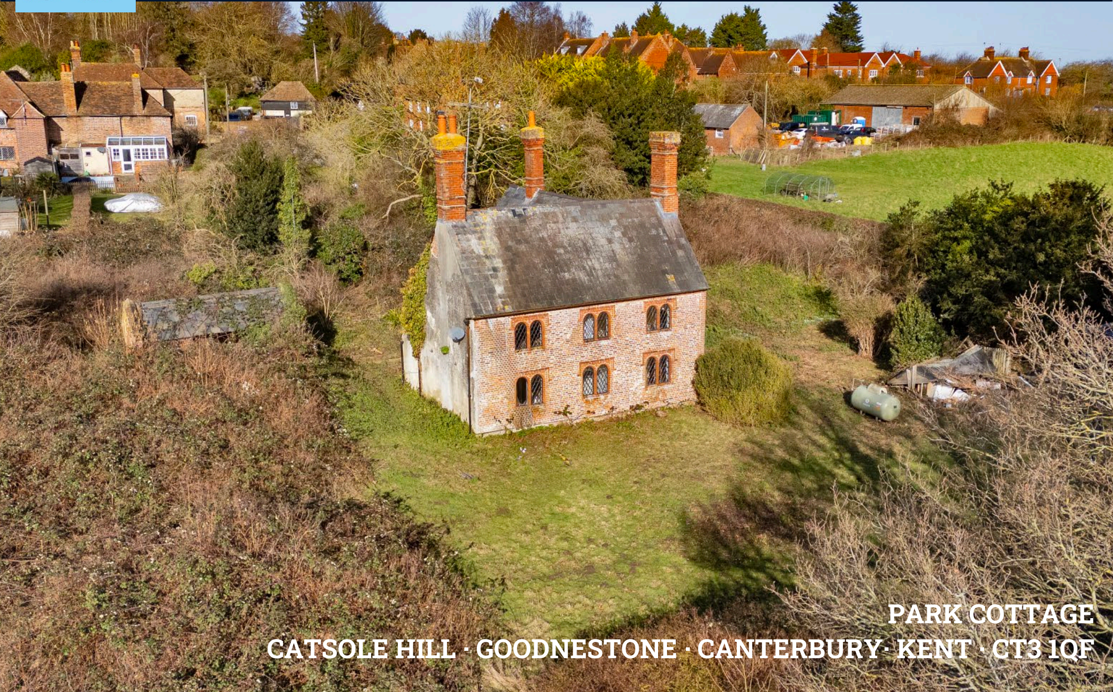
PARK COTTAGE CATSOLE HILL · GOODNESTONE · CANTERBURY · KENT · CT3 1QF