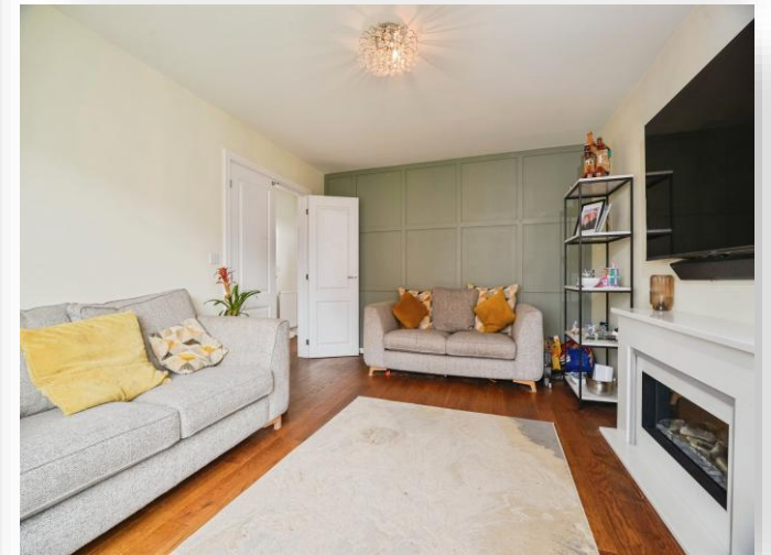
Sculptor Crescent, Stockton-On-Tees TS18 3WD