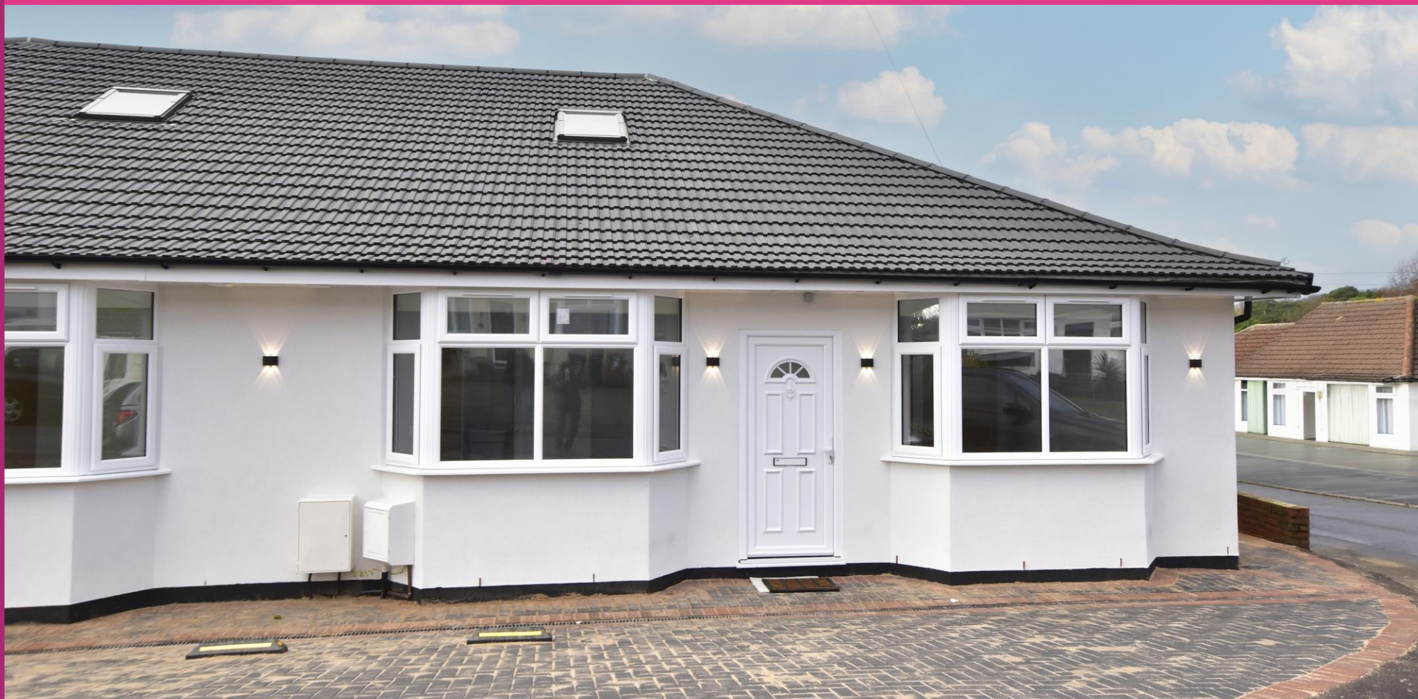
THE COURTWAY, WATFORD - £650,000 3 Bedroom Semi-Detached House