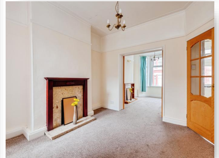
Rosedale Road, Birkenhead, CH42 5PQ