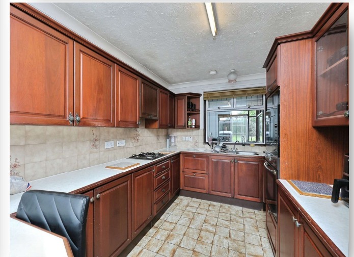
Buckingham Road, Norwich NR4 7DE