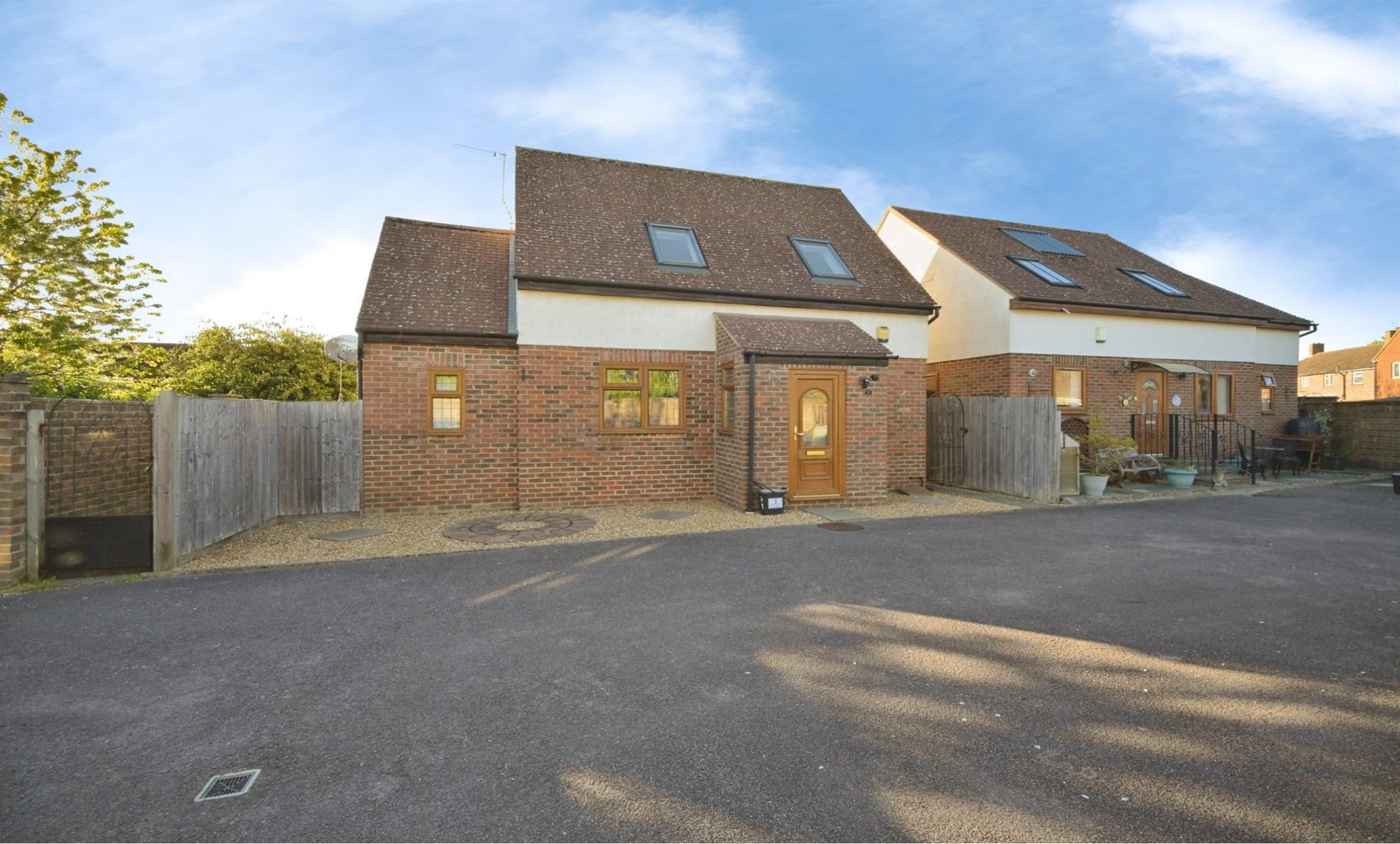
Blackbird Cottages Stortford Road, Hatfield Heath Bishop's Stortford CM22 7DU