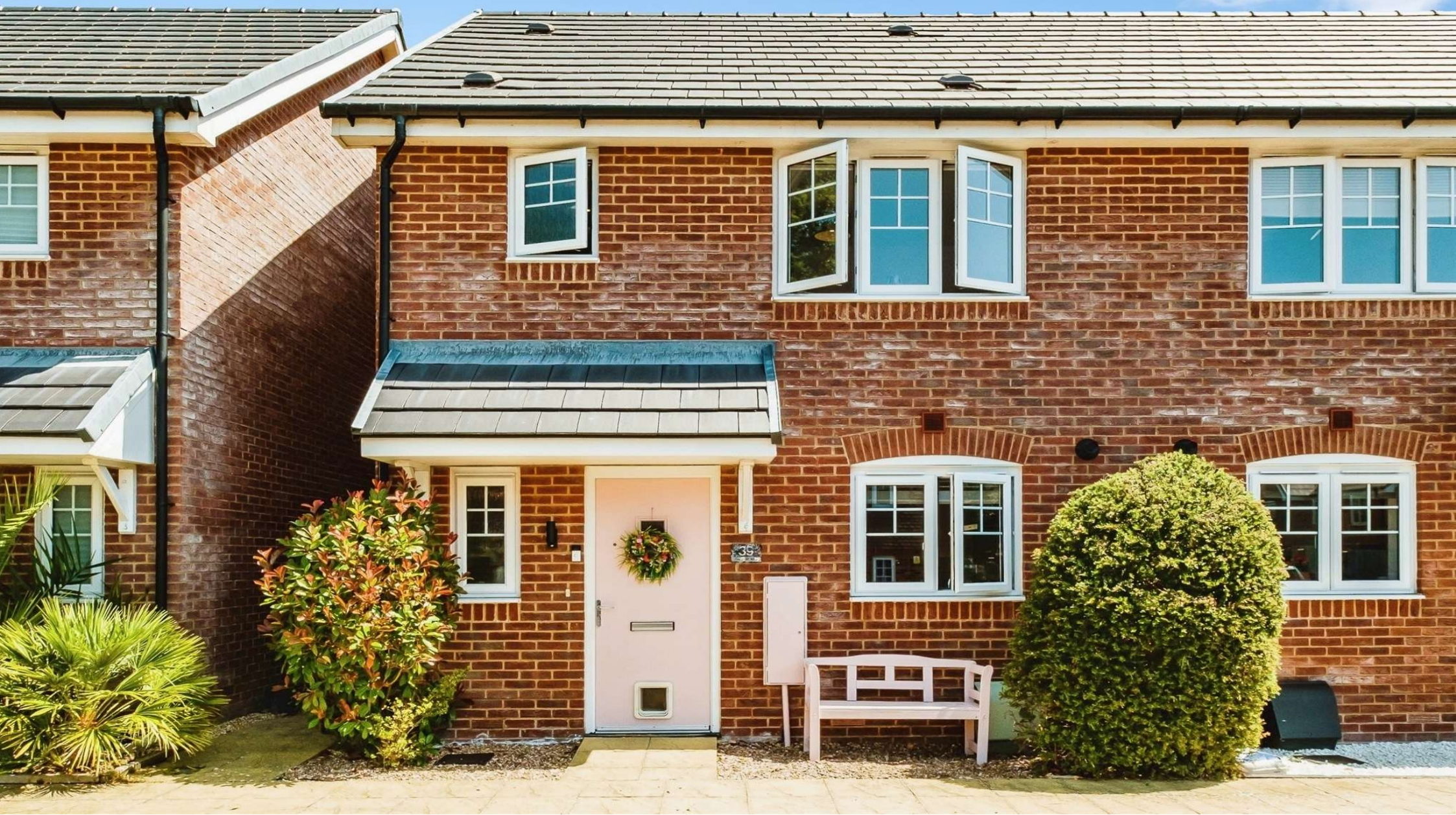
Cornfield Way, Worthing BN13 3FY