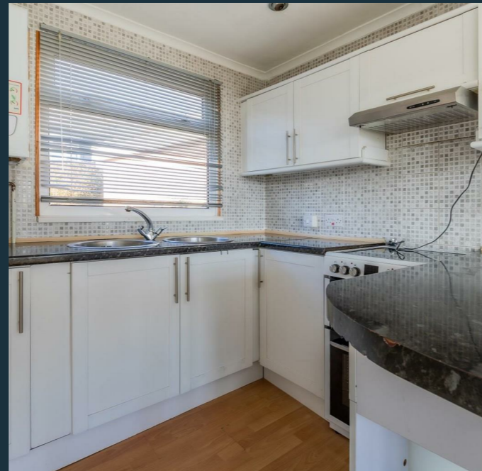
Marconi Holiday Village