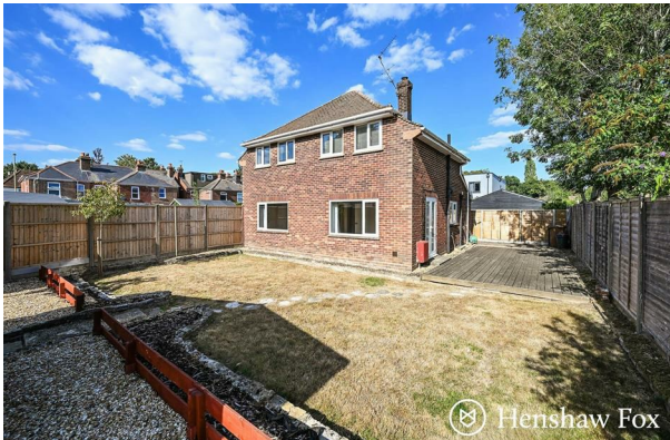
Priestlands, 109a Winchester Road | £600,000 Romsey, Hampshire, SO51 8JF