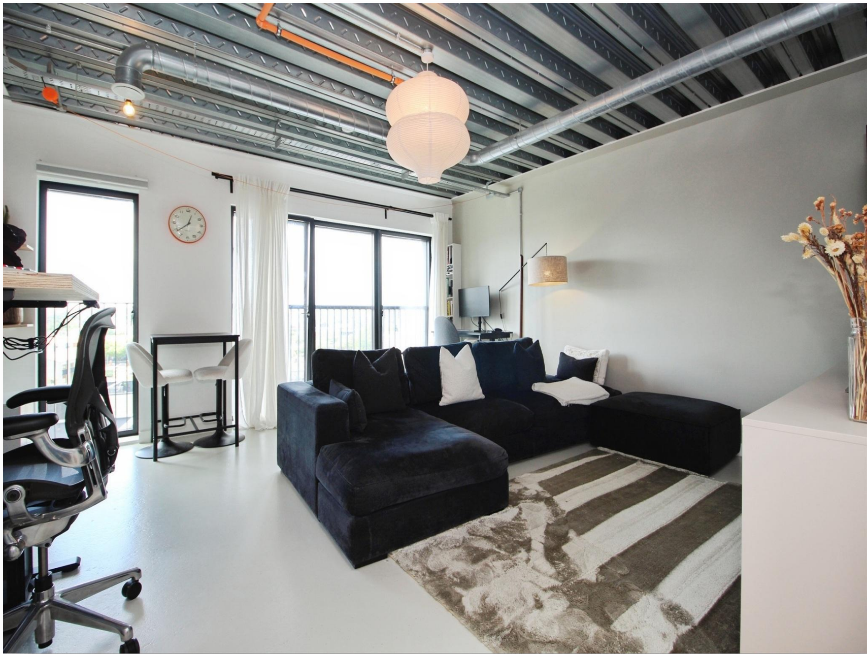
Aire Lofts Happy Walk, LEEDS LS9 8FZ