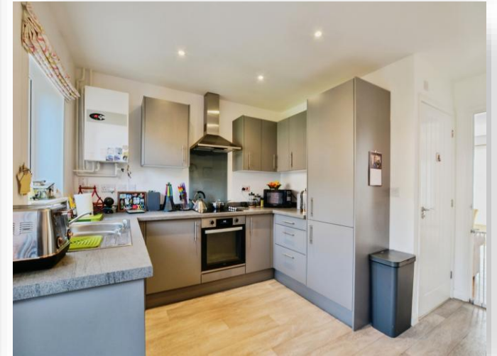
Draycott Way, Chapel St. Leonards Skegness PE24 5WG