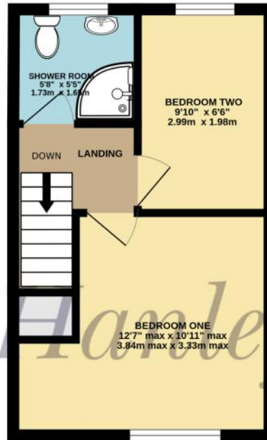
1ST FLOOR 259 sq.ft. (24.1 sq.m.) approx.