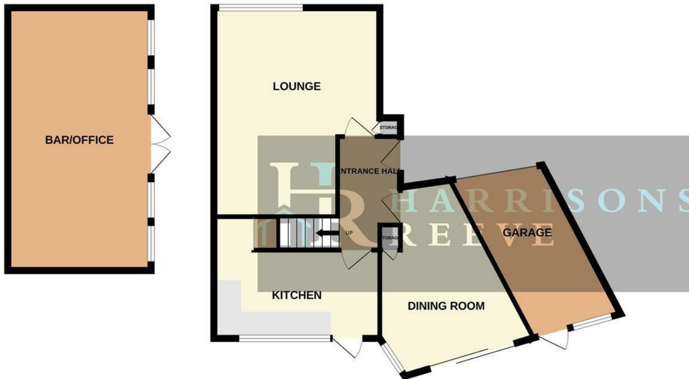
GROUND FLOOR 907 sq.ft. (84.2 sq.m.) approx.