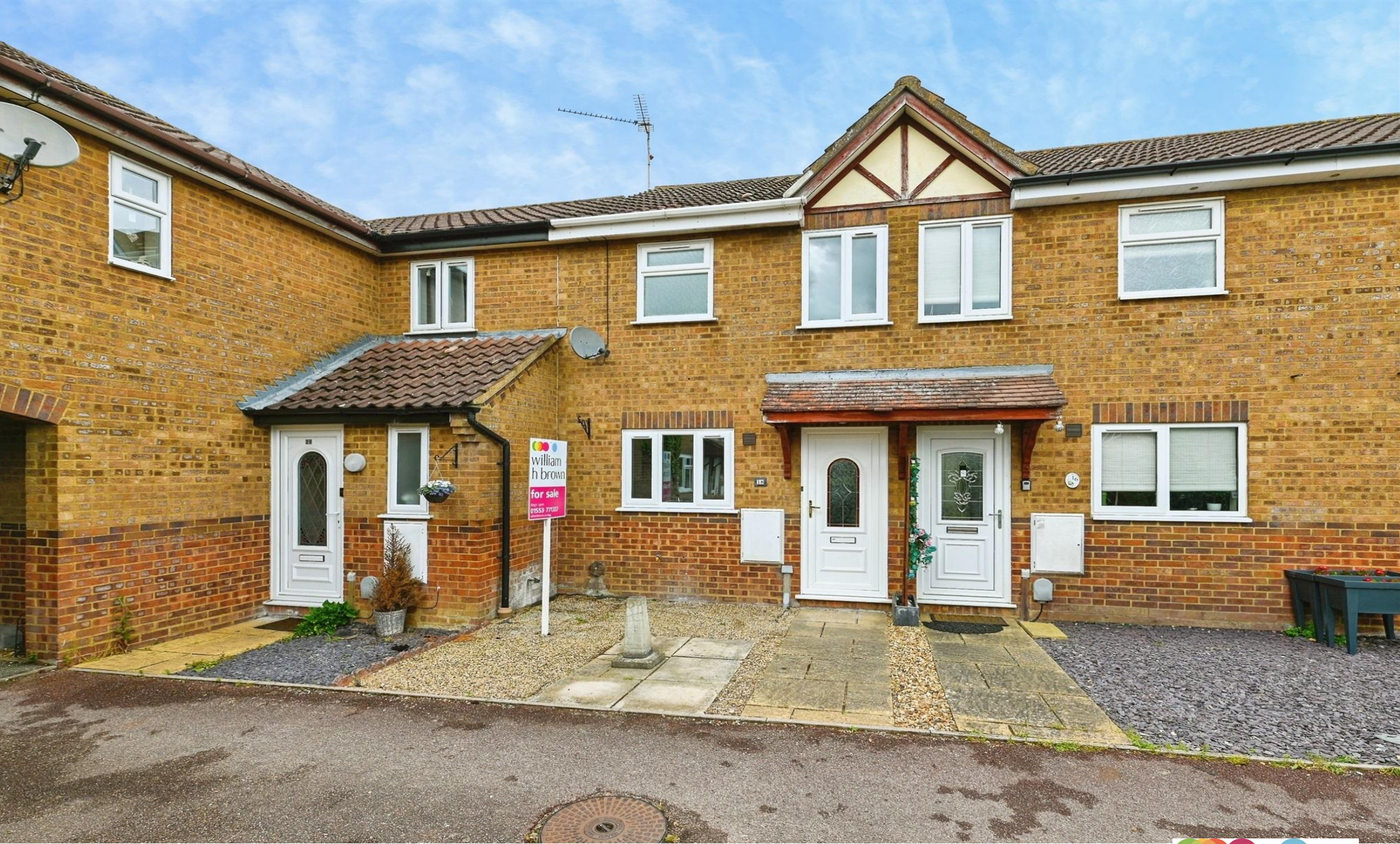
Aylmer Drive, Tilney St. Lawrence, King's Lynn, PE34 4RQ