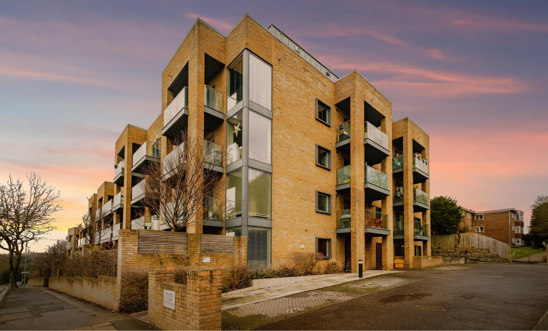
Park House Hove Park Gardens, Hove BN3 6AJ