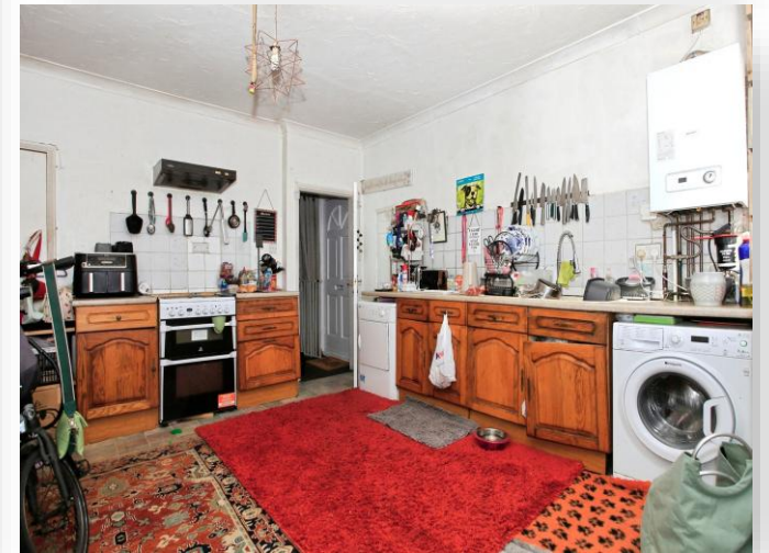
Belsize Avenue, Peterborough PE2 9HZ