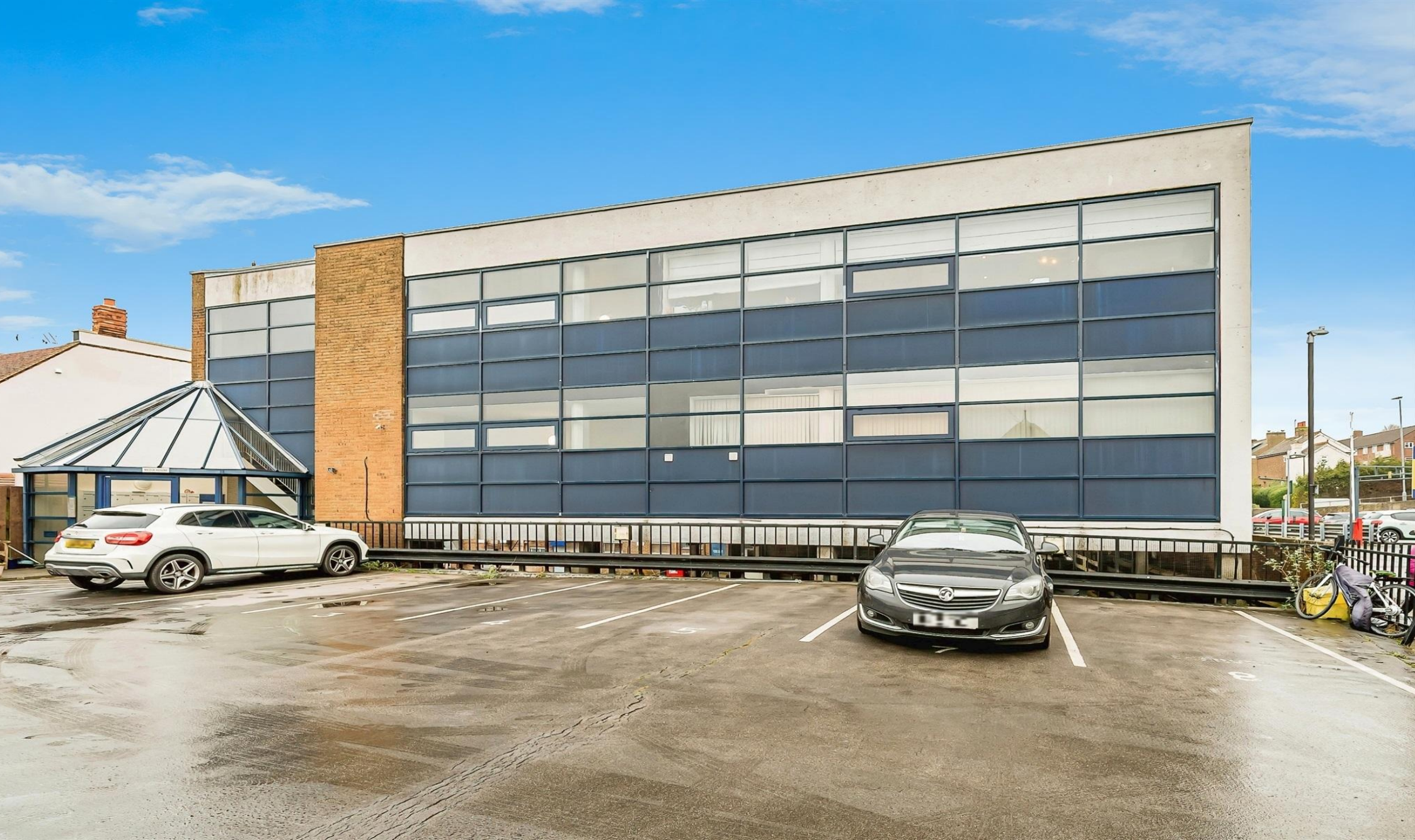
Media House, The Backs, Chesham HP5 1DU