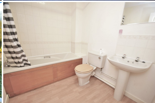
One bedroom furnished apartment in the popular Westwood Road area.