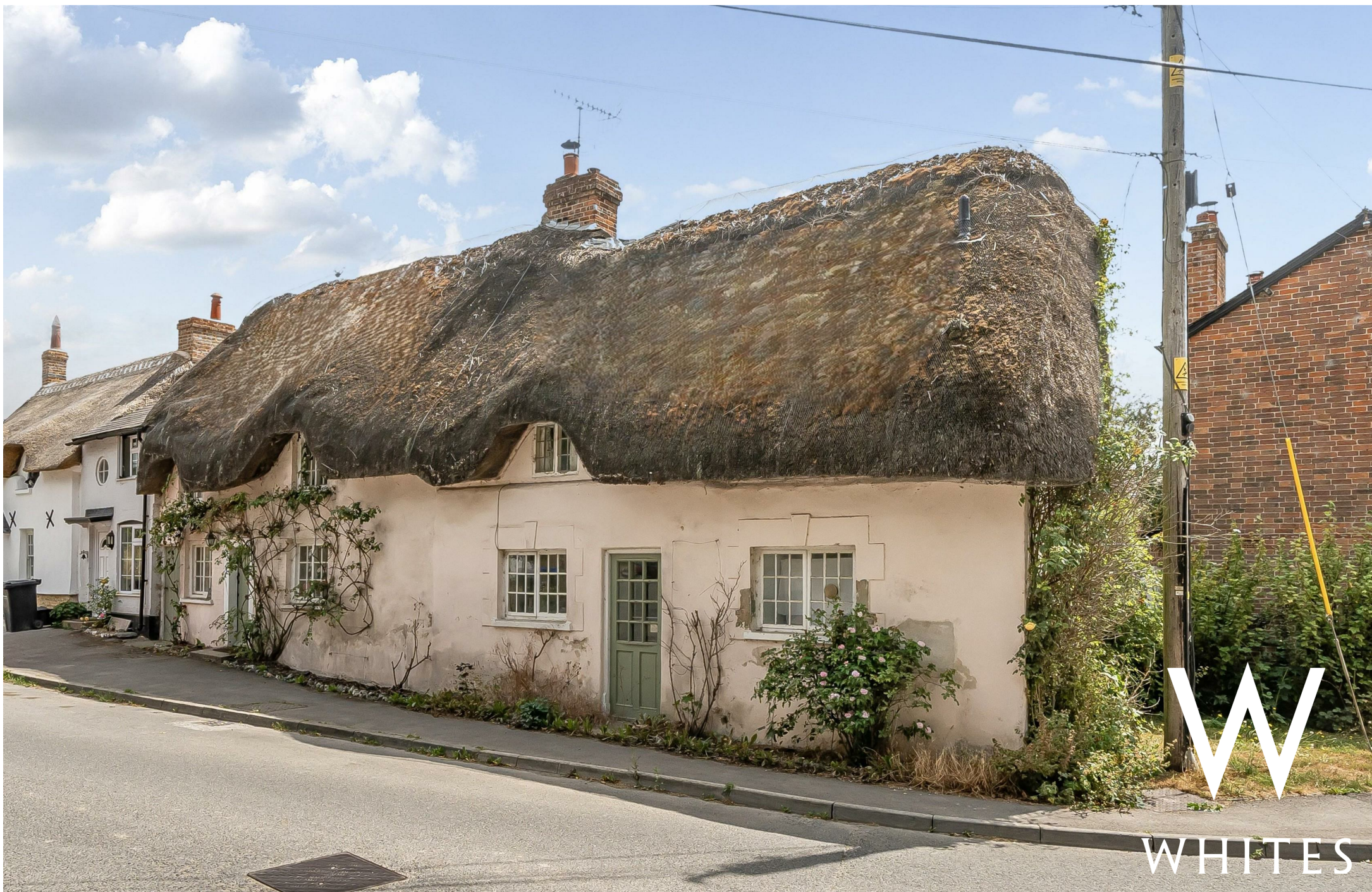
Trapps Cottage The Pound, Haxton, Salisbury, Wiltshire, SP4 9PP