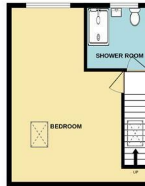
2ND FLOOR 346 sq.ft. (32.2 sq.m.) approx.