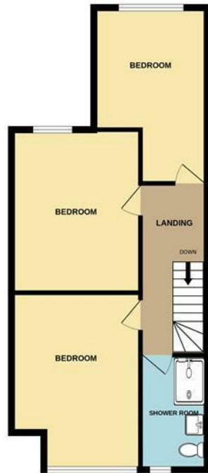
1ST FLOOR 561 sq.ft. (52.2 sq.m.) approx.