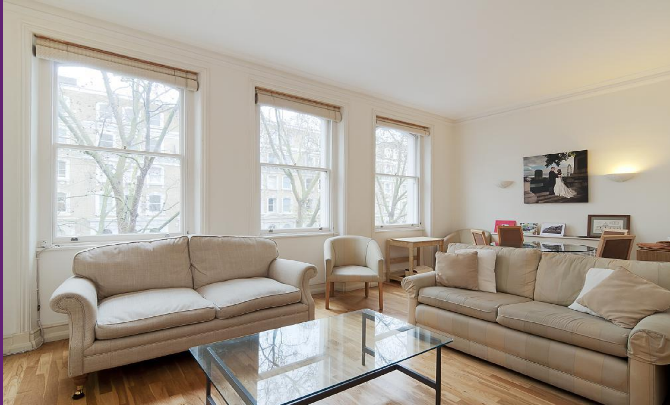
Beaufort Gardens Knightsbridge, SW3