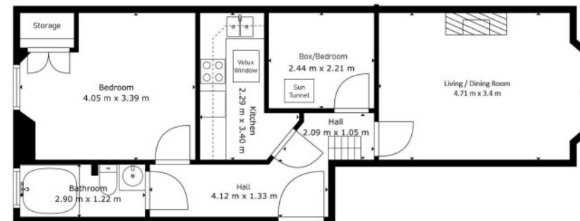
Top (Third) Floor